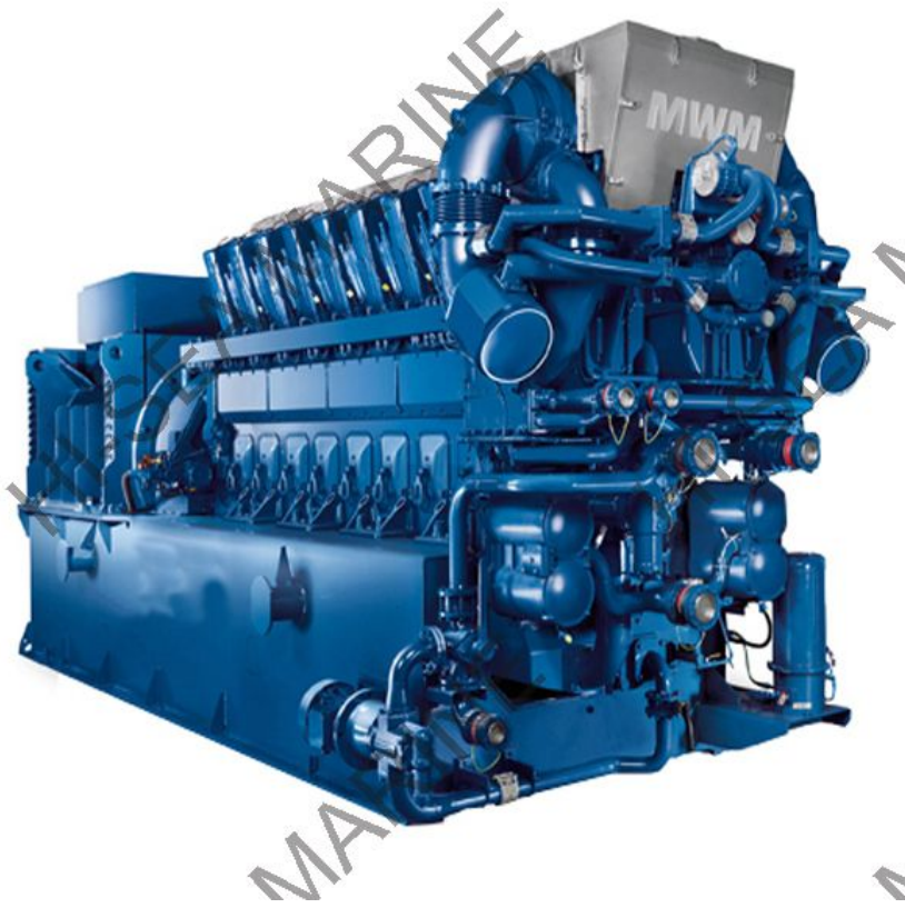
1300kw MWM marine generator set