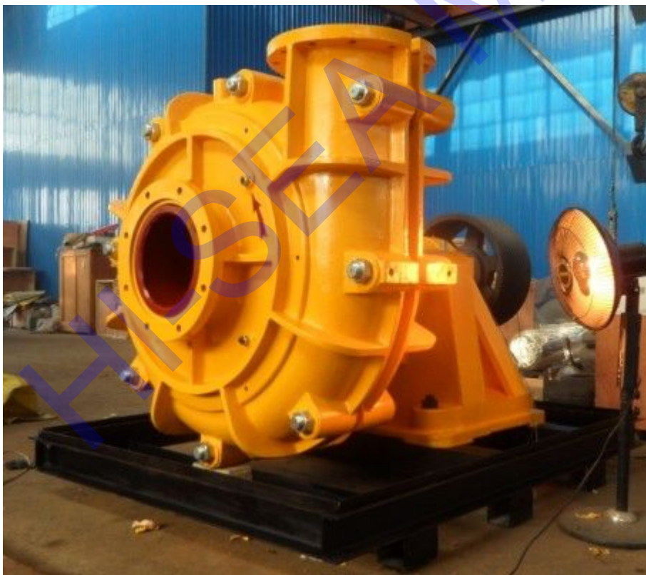
double-walled dredge pump in factory

NOTE: According to user's or design and manufacturing drawing.