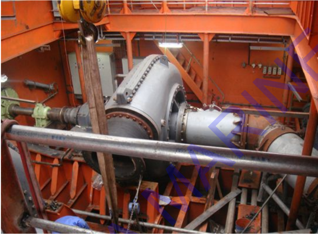
double-walled dredge pump on the dredger