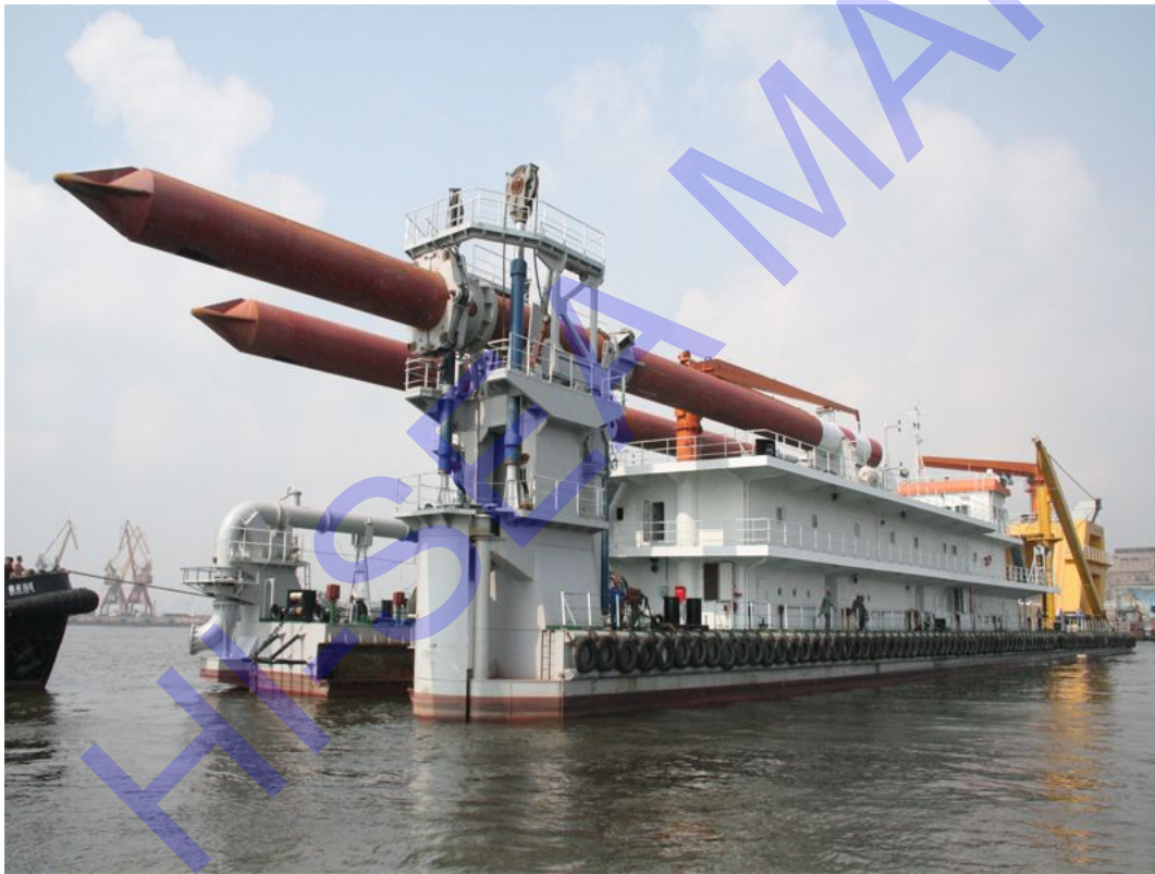
spud carrier on CSD