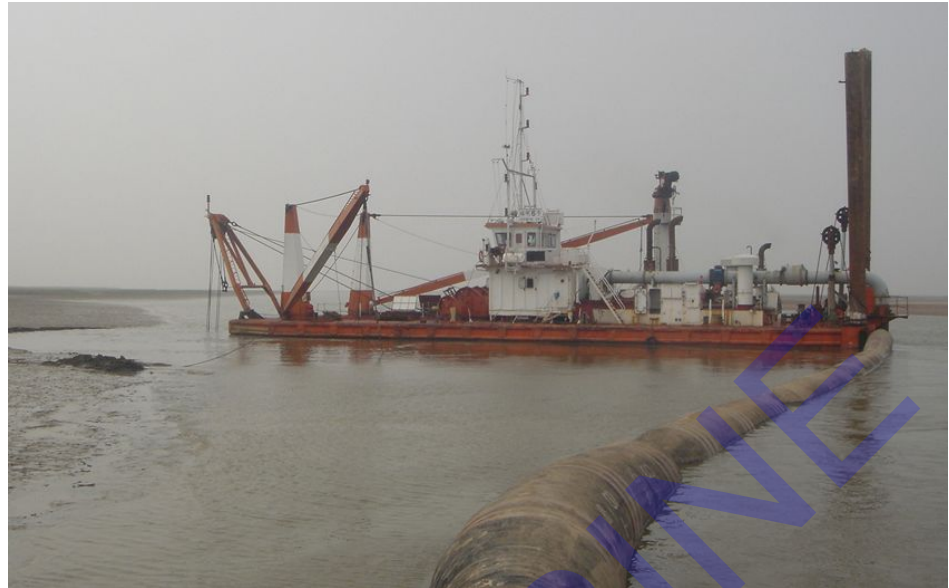
spud carrier on CSD or WSD