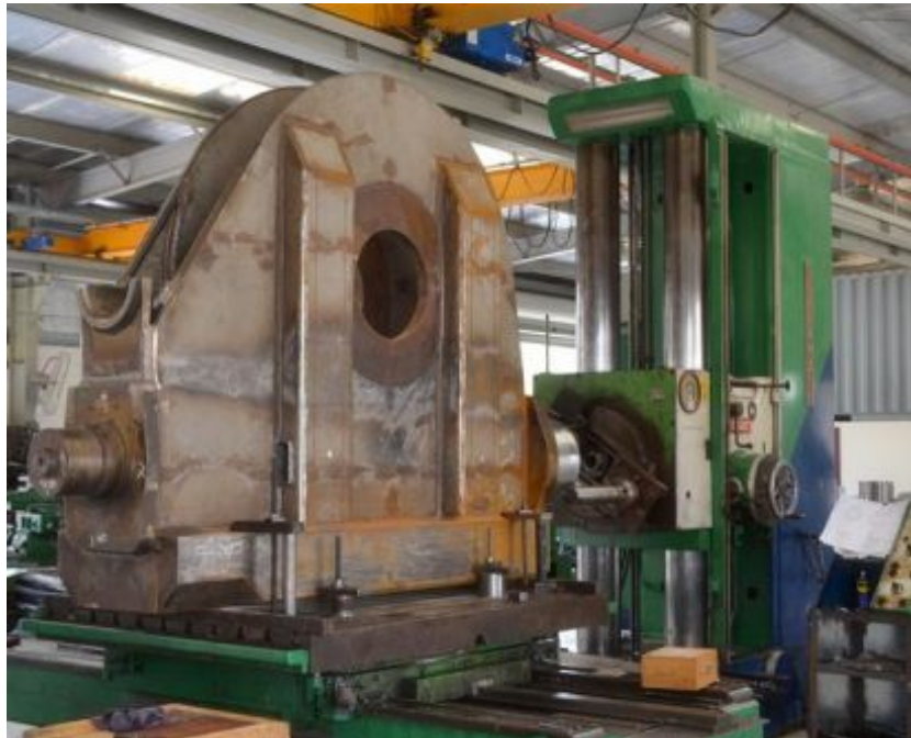
side wire blocks in factory

The cable sheave is a welded steel sheave with a hardened groove and a watertight encased bearing. The diameter of the sheave is chosen extra large, to reduce wear on the cable. Replaceable wear rings are fitted to guide the cable into the sheave.