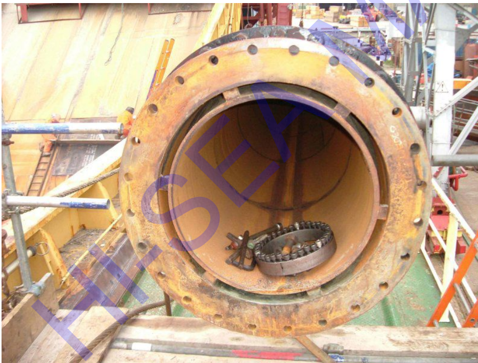
maintenance and installation

Chongqing Hi-Sea Marine Equipment Import&Export Co.,Ltd.