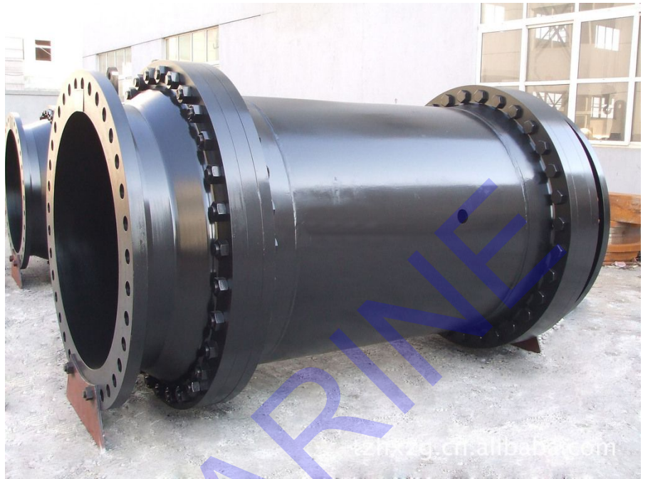
Dredge Turning Gland Ready to shipping