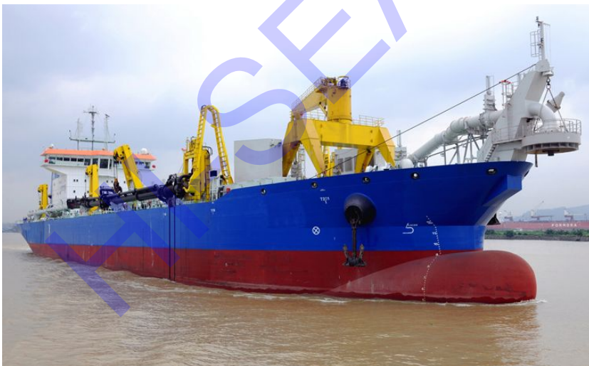
dredge side suction system on the TSHD