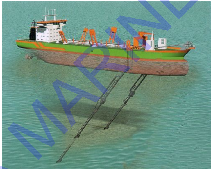
Dredge Side Suction System Working Picture

The side suction pipe is fitted with rubber fenders to prevent damage to the ship's hull when hoisting the suction pipe on board. The side suction pipe is a strong steel welded construction with some cast steel parts. The dredge line and jet line are fitted with rubber flexible hoses to accommodate the movements of the pipe.